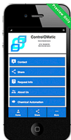
ControlOMatic Phone APP

CA Title 22, Oregon Health Compliant w/TrueDPD