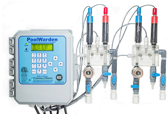
Pre-Mounted Dual System P/N PW-DMTD